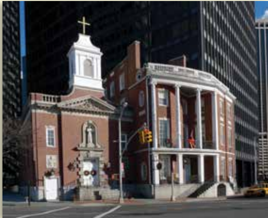
Shrine of St. Elizabeth Ann Seton at Our Lady of the Rosary Parish State Street, New York City

“Contemplate how you are being asked to give your heart to God amidst your everyday activities. Be prepared to meet your grace in every circumstance of life.”