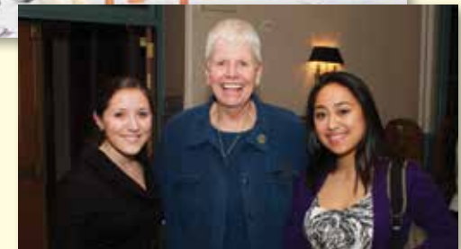
College of Mount Saint Vincent students host Thanksgiving dinner with the Sisters.