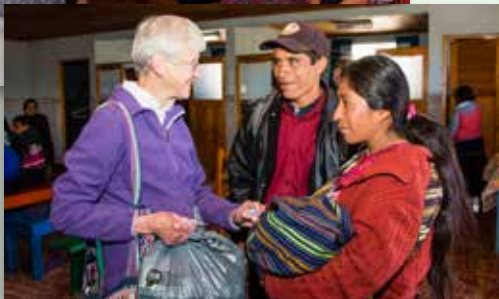
Sisters of Charity serving the people of Guatemala, Central America ...