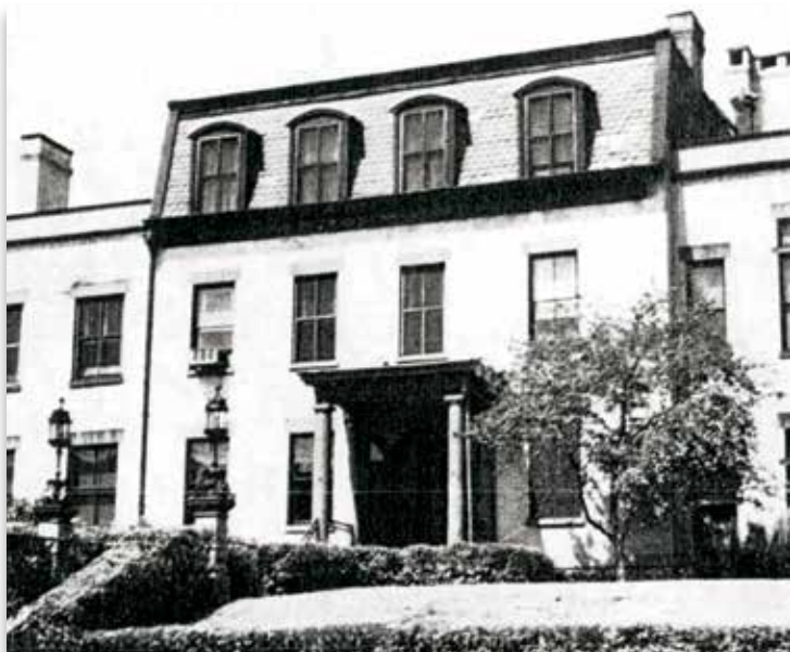
Grace Institute's original mansion serves as the school until the early 1960s. It opened its doors in January 1898 to approximately 300 students, offering secretarial courses which enabled graduates to apply for jobs in the business world.