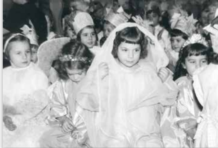
Holy Name Day Nursery opened in 1921 for pre-school-aged children whose mothers were obliged to work.