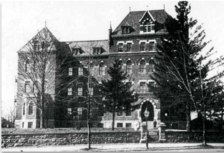
St. Joseph's Hospital, Yonkers, erected in 1888, formally opened to the public on March 19, 1890.