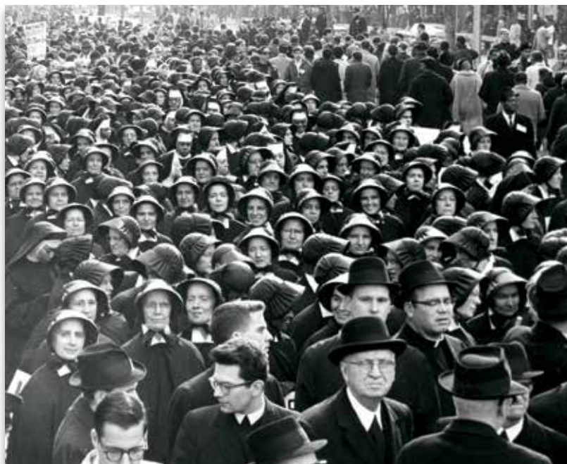
The Sisters of Charity were among many religious groups and laity who gathered in Harlem in 1965 in support of civil rights and equality for all.