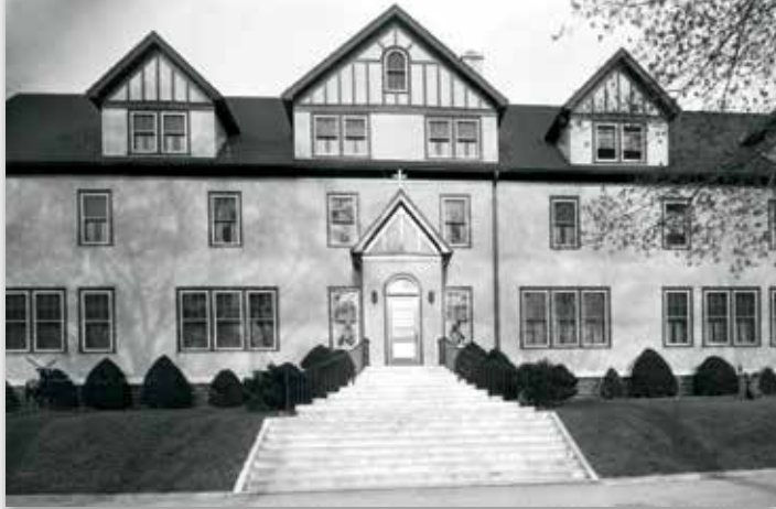
St. Patrick Villa, a residence for senior sisters, is the fulfillment of a long-cherished plan on the part of the mothers general and the council. A generous gift by Cardinal Hayes made it possible to begin construction in 1929.