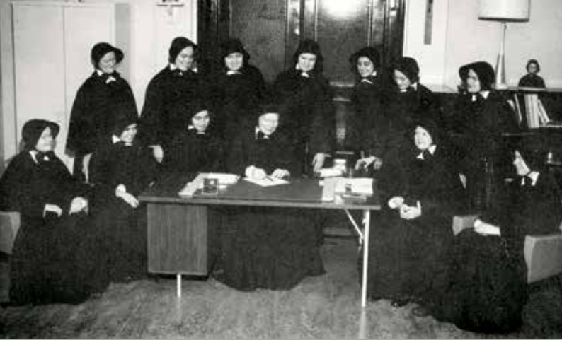
Sisters gather at Saints Peter and Paul School in the Bronx.