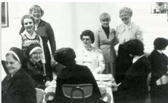
A group of sisters meet for recreation shortly after the option for personal dress began; one can see the traditional habit, the modified habit, and several sisters wearing the "dress of the day."