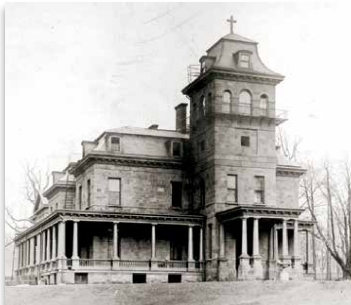
St. Vincent's Hospital, Staten Island, was formally blessed by Cardinal Farley on November 26, 1903.