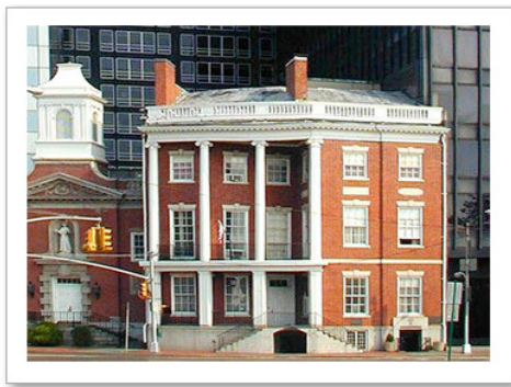
Shrine of Saint Elizabeth Seton in lower Manhattan, NYC

“Contemplate how you are being asked to give your heart to God amidst your everyday activities.