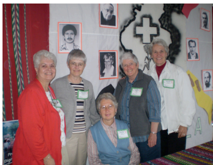
Sisters of Charity serving the poor in Guatemala, Central America