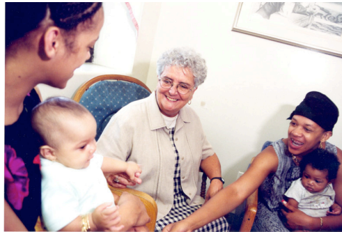
Serving in New York in ever new ways!

“Our mission as Sisters of Charity is to share in the ongoing mission of Jesus by responding to the signs of the times in the spirit of Saint Vincent de Paul and Saint Elizabeth Ann Seton, by revealing the Father’s love in our lives and in our varied ministries with and for all in need, especially the poor.”